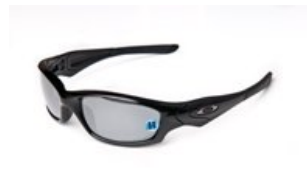
Procurement are appointed official distributor for Oakley Sun-glasses

Procurement International being awarded it's first big accolade "the British Promotional Merchandise Association's Company of